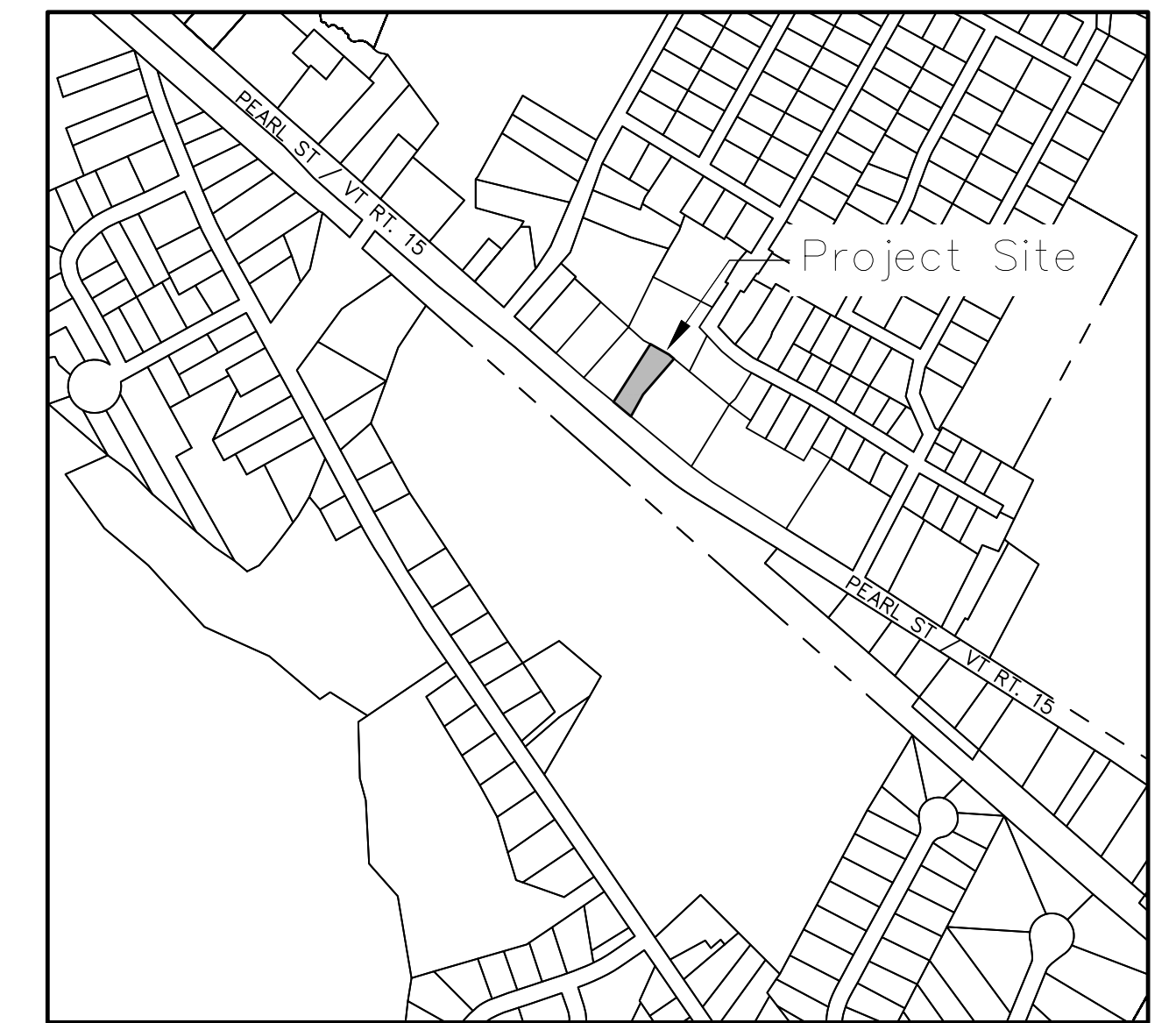
Location Map Scale: 1" = 500'