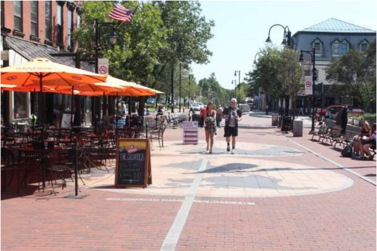
Many restaurants on the Church Street Marketplace in downtown Burlington offer outdoor seating.