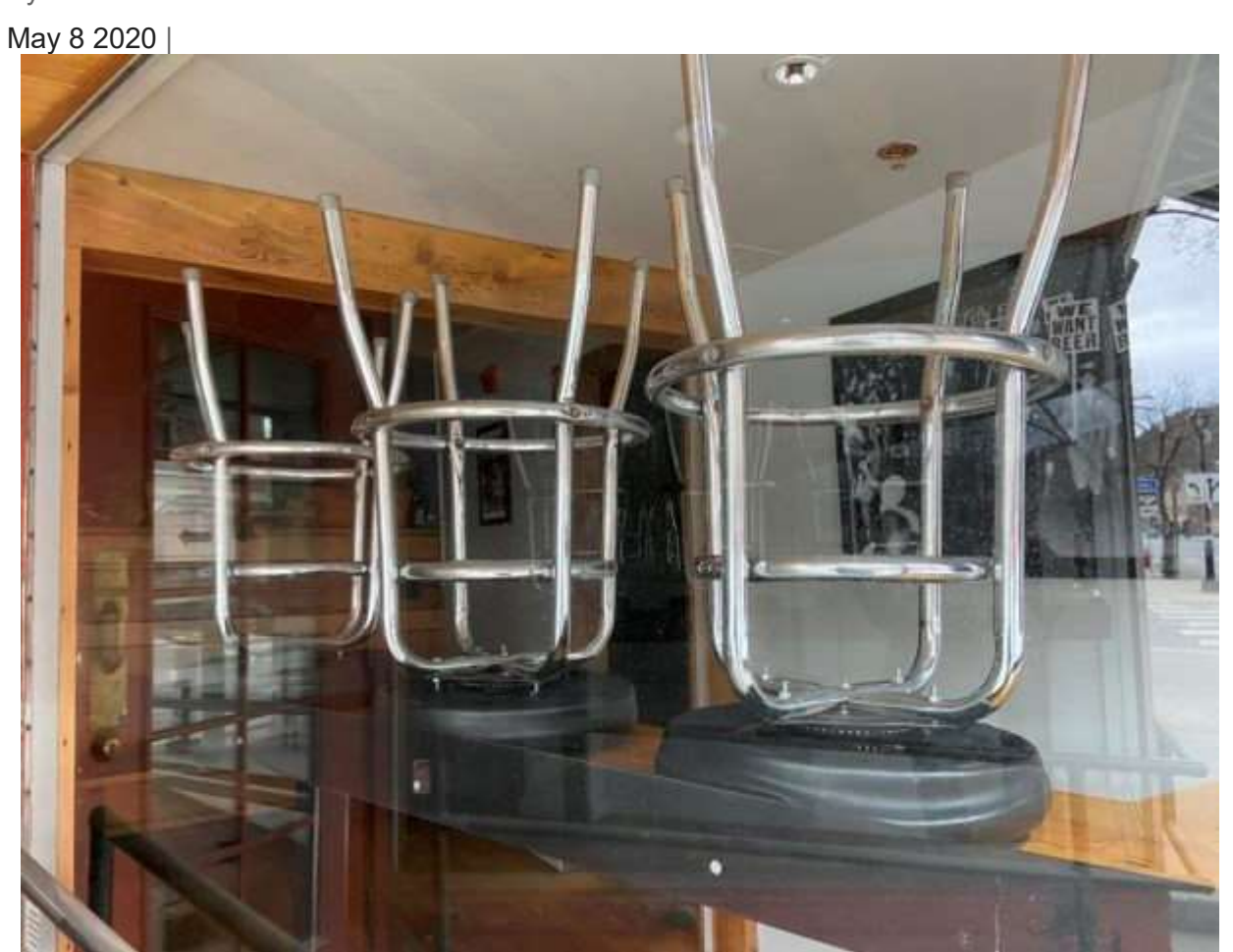
The Three Penny Taproom in Montpelier is among restaurants and bars closed during the coronavirus pandemic.

VTDigger posts regular coronavirus updates on <u>this page</u>. You can also <u>subscribe here</u> for daily coronavirus news. Please send your Covid-19 questions to <u>coronavirus@vtdigger.org</u>.