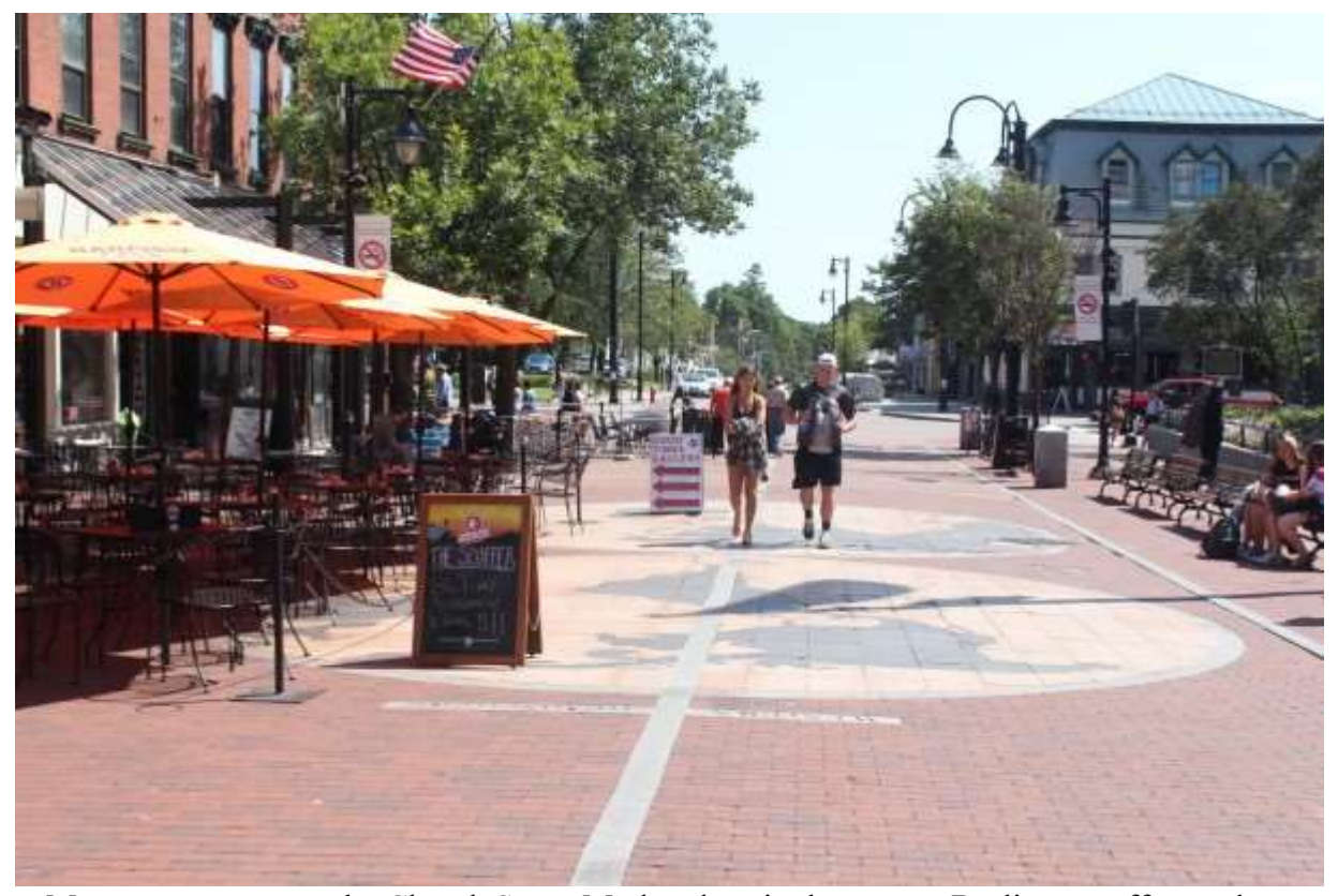
Many restaurants on the Church Street Marketplace in downtown Burlington offer outdoor seating.