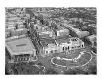
Burnham Place, part of the Washington Union Station Master Plan, received the American Institute of Architects' Institute Honor Award for Regional and Urban Design. Burnham Place is envisioned as a 15 acre mixed use, transitoriented neighborhood to be constructed north of the station and above the operating rail yard.