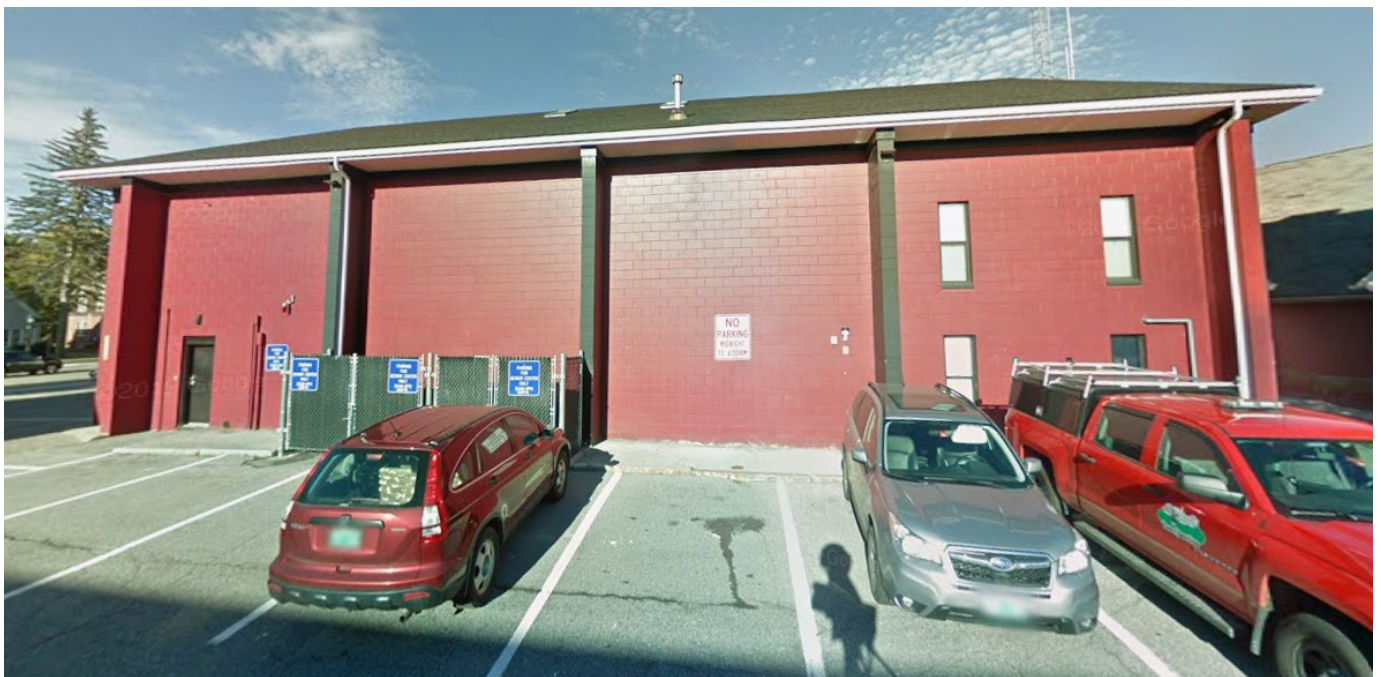
Figure 1: Existing conditions at the selected mural location, the southeastern facing exterior wall of the Fire Department.

The site is regularly accessed by a variety of residents and visitors through a range of transportation modalities: pedestrian, cyclists and automotive. Furthermore, the pavilion and tables in front of the Library and the benches of the adjacent Veterans Memorial Park both provide stationary locations from which to view and enjoy the planned mural.