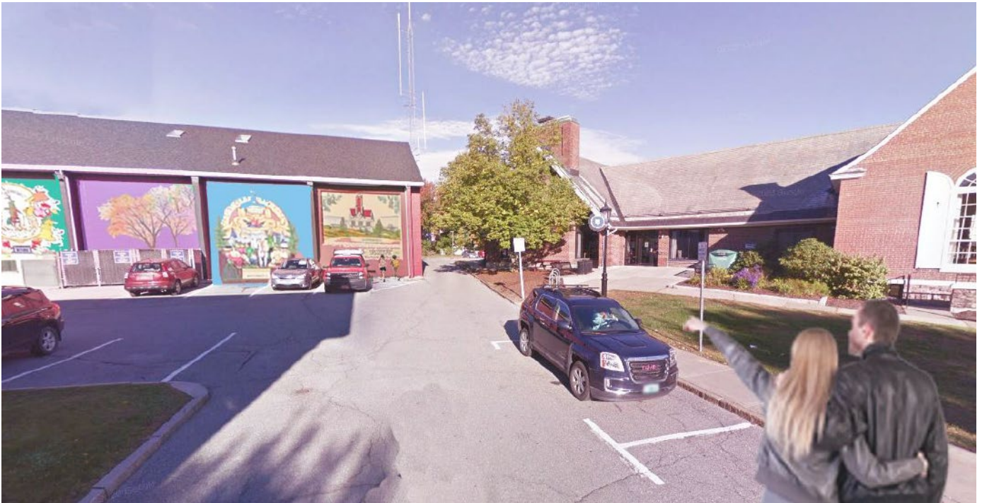
Figure 3: Rendering of potential mural concepts for the project site for demonstration purposes only.