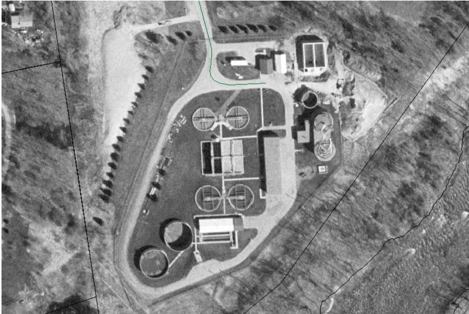
Essex Jct WWTF Refurbishment